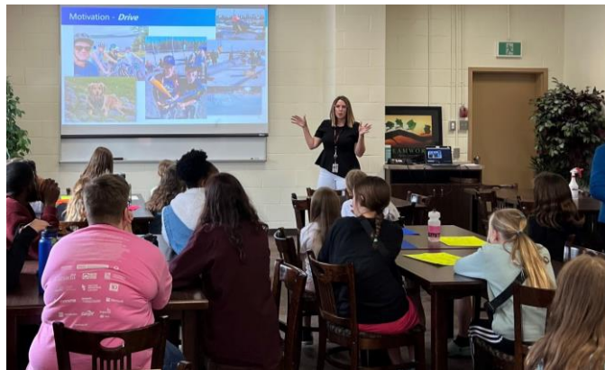
HMDC representative attended the GirlQuest Camp to talk with STEM loving students about her career as an engineer.