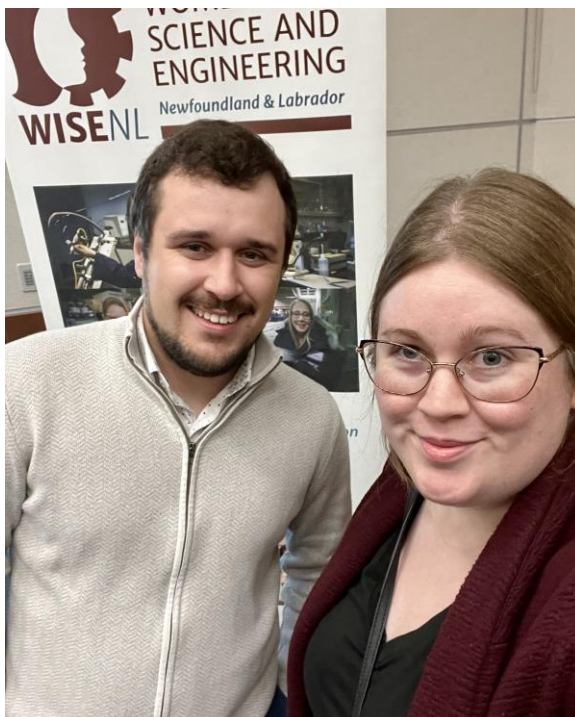
HMDC representatives attended the WISE NL Student Summer Employment Program Final Presentation Day at Memorial University.